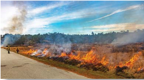
34 - Controlled Burn at Point Lobos State Natural Reserve.jpg