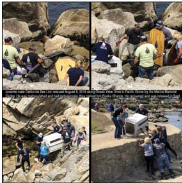
21 - Sea Lion Rescue in Pacific Grove on August 8, 2018.jpg

Delightful image. Great expression on live dog's face. Minimal photojournalism elements. .