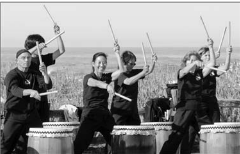
41 - Drummers on sunset avenue pg.jpg

Impactful image that needs no explanation. Strong emotional impact, informative story tellings.