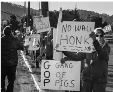
31 - Protesters Gather Against Donald Trump's Border Emergency in Monterey.jpg

Strong news worthiness; has emotional impact and meets all photojournalism criteria. 4-Stars.