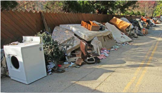
After the Guerneville flood