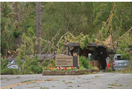
43 - Storm Damage.jpg

This image does an excellent job of showing the impact on people from this year's rains and flooding.