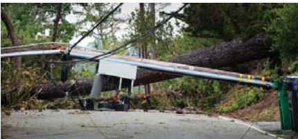
02 - Storm blows down trees and power residence without wer for 4 days, Roads were blocked making it difficult to get around Pebble Beach.jpg

Weather was a big news item this year. Photo captures the impact.