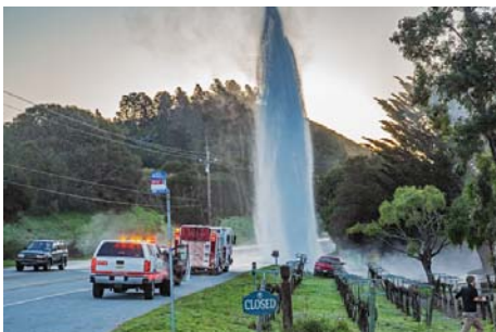
09 - Aftermath of a DUI at Folktale Winery on Carmel Valley Road. jpg

Powerful image that tells the story of this year's severe weather. Honorable Mention..