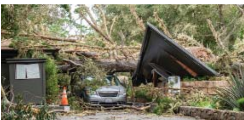
23 - Pebble beach Employee and visitor narrowly escape being crushed to death by Monterey pine tree falling on guard house and partially crushing visitors vehicle In a very unusual winter storm with wind gusts Blowing at 50 plus.jpg

Weather was a big story this year and this image does a great job of telling the story.