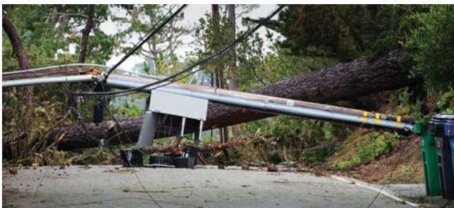
Storm blows down trees and power residence without wer for 4 days, Roads were blocked making it difficult to get around Pebble Beach