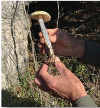
30 - Ranger Explains Features of Very Poisonous Mushroom Amanita phalloides (Death Cap).jpg