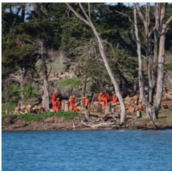
07 - Inmate Crew Working on Elkhorn Slough Eucalyptus Tree Remediation Project.jpg

Delightful image with great capture of facial expressions and body language. .