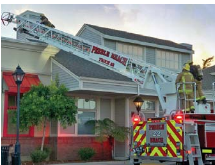
37 - 2. Safeway Evacuated_Firefighters Climb Up the Ladder.jpg

Good photo but lacks photojournalism elements.