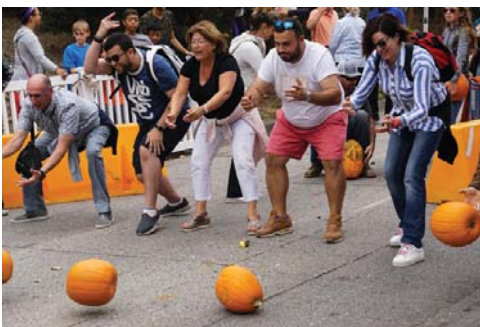
32 - Participants launch pumpkins down Ocean Avenue in Carmel's Annual Pumpkin Roll-05980.jpg

Strong news worthiness; has emotional impact and meets all photojournalism criteria. 4-Stars.