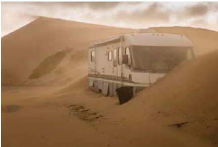
08 - Windstorm Smothers Sand City California.jpg

Nice colors and good composition, however, image lacks journalistic value and newsworthiness..