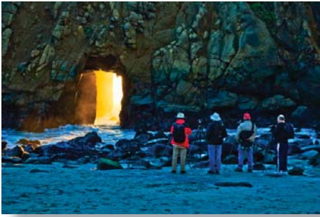
10 - Photographers waiting for sunset at Pfeiffer Beach Arch.jpg

Well composed image. Good storytelling elements..