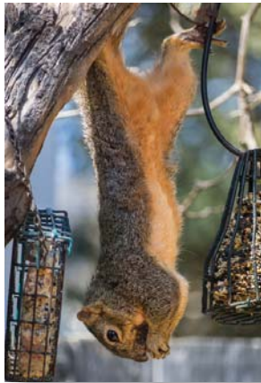
35 - Backyard acrobat, Pacific Grove, March, 2019.jpg

Cute photo. Lacks photojournalism elements..