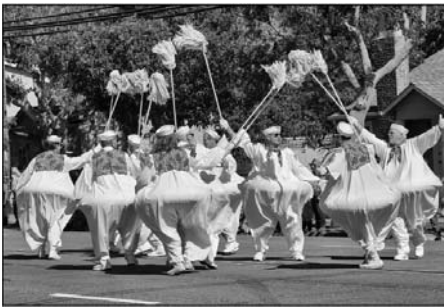
06 - Legendary balloon platoon - pacific grove good old days parade. jpg

Well done image, however, for Photojournalism, it lacks emotional impact and newsworthiness.