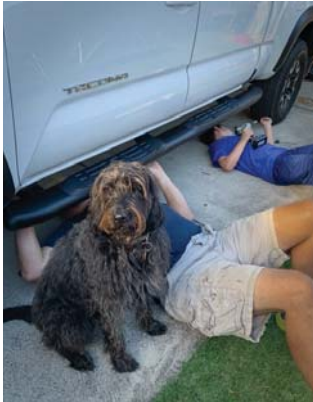
11 - The boss and his workers, Kailua, Hawaii, March, 2019.jpg

Well composed image. Good storytelling elements..