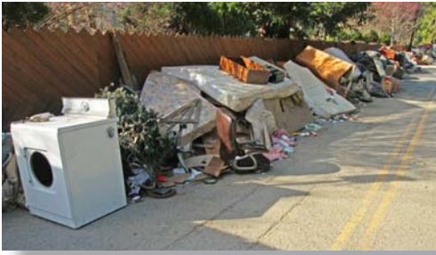
39 - After the Guerneville flood .jpg

This image does an excellent job of showing the impact on people from this year's rains and flooding.