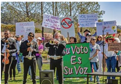
27 - Opposition to Arizona Sheriff Joe Arpaio's Appearance in Carmel Valley.jpg

Good composition and nice colors. Has some "story" value, but needs more to get it across.