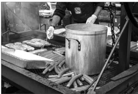
42 - Going for the dogs bw - pacific grove 4th of july picnic in jewel park.jpg

Fun, enjoyable photo. Photo journalism value is unclear.