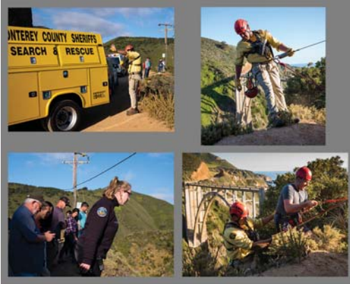
15 - Bixby Bridge Stranded Hiker Rescue May 14 2018.jpg

Great sequencing; high emotional impact. Storyline is unclear—could be a rescue or just a training exercise..