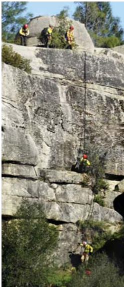
04 - Monterey County Sherrifs Search and Rescue practice rappelling in Los Padres Nation Forest.jpg

Nice image. Newsworthiness is not apparent.