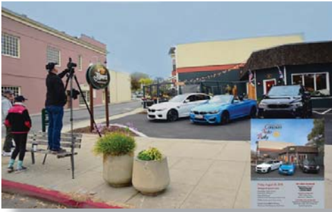
29 - Taking of the Picture for the Pacific Grove Auto Rally Magazine Cover 2019.jpg