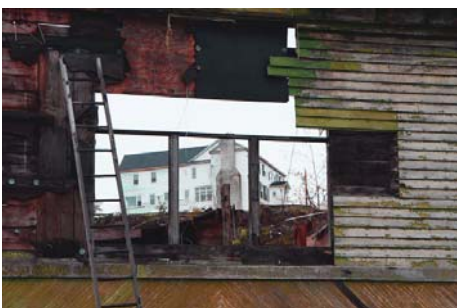
14 - Looking Through Missing Wall of One Home at Another Home Damaged by Severe Storm in MA.jpg

Well composed and interesting. Photojournalism quality is questionable..