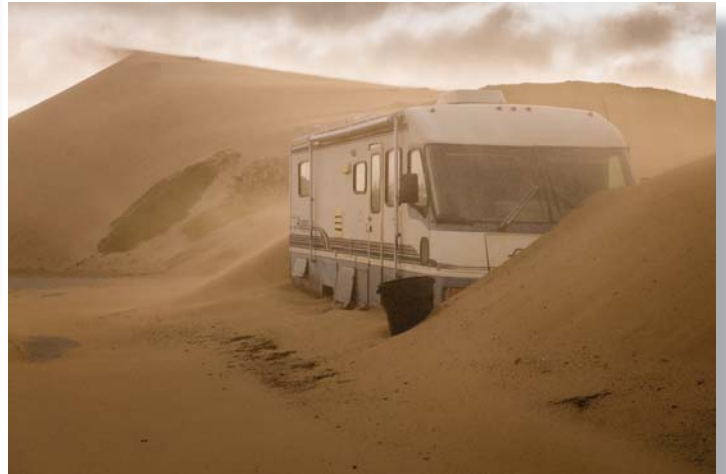
Windstorm Smothers Sand City California