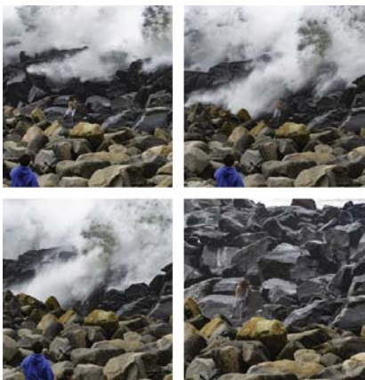
13 - Big waves crash onto teenager on jetty in Morro Bay, California.jpg

Great photo; outstanding facial expressions and body language. Good story-telling qualities.