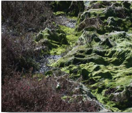
05 - Algae Bloom Engulfing Pickle Weed Resulting in Erosion.jpg

Well done image, however, for Photojournalism, it lacks emotional impact and newsworthiness.