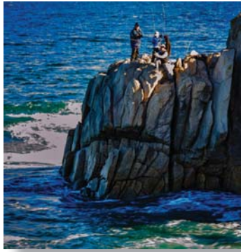
19 - Fishing precariously at Lovers Point.jpg

Well composed image. Minimal photojournalism elements.