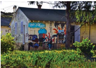
03 - Dilapidated Building on Fort Ord - A Street Artist's Canvas .jpg

Weather was a big news item this year. Photo captures the impact.