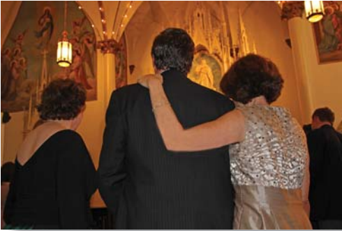
40 - Consoling.jpg

This image does an excellent job of showing the impact on people from this year's rains and flooding.