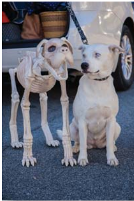
20 - Friend or Foe_ Dogs and spooks come out for Halloween in Carmel Valley, CA.jpg

Well composed image. Minimal photojournalism elements.