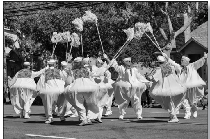
Legendary balloon platoon - Pacific Grove Good old days parade.