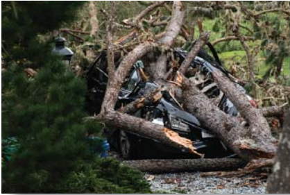
25 - Howling winds topple trees into houses and cars such as this Honda Accord, Car was parked outside of house and no one was in vehicle.jpg

Excellent portraiture. Story value is unclear.