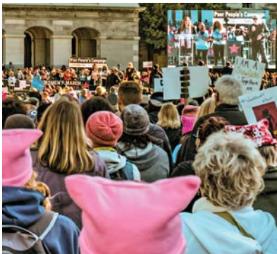
22 - Women's March Sacramento CA Jan 20 2018.jpg

Impactful sequence. Great "Story" quality.