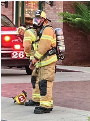
36 - 1. Safeway Evacuated_Firefighters Don Their Exposure Suits. jpg

Cute photo. Lacks photojournalism elements..