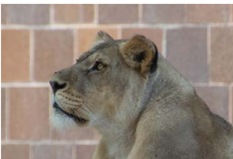
33 - Lion caged in a cinderblock prison in the Omaha zoo.jpg

Delightful photo with great capture of body language and facial expressions..