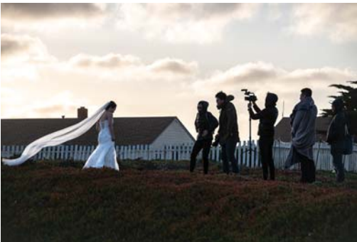
17 - Wedding Shoot at Pigeon Point Lighthouse on a cold, windy day.jpg

Cute photo, but lacks most of the photojournalism elements.