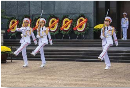
01 - Changing of the Guard at Ho Chi Minh Memorial, Hanoi, Vietnam.jpg