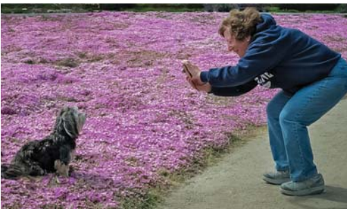
16 - Everybody wants their picture taken, Pacific Grove Coastline.jpg

Great sequencing; high emotional impact. Storyline is unclear—could be a rescue or just a training exercise..