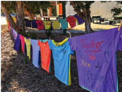
26 - Victims of violence and abuse participate in the Clothesline Project at the Naval Postgraduate School.jpg

Impactful image reflecting this year's violent weather.